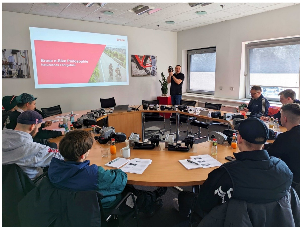
On the first of two dates, Brose welcomed eight apprentices and one teacher for training