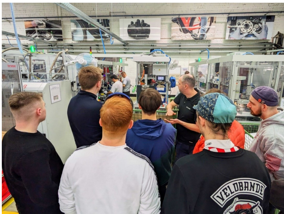
During the factory tour, the apprentices learnt about the production processes at the Brose plant in Berlin

Brose drive technology GmbH & Co. Limited partnership, Berlin