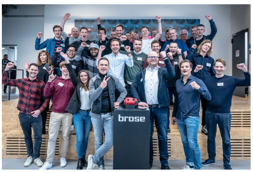
The Brose team is delighted with the great success.

Brose drive technology GmbH & Co. Limited partnership, Berlin